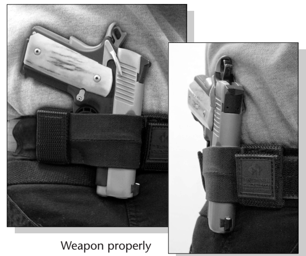
Weapon properly seated in Zip Slide®

To secure the weapon, insert it into the holster with the trigger finger off of the trigger, outside of the trigger guard . Lightly push the weapon in until the trigger guard catches in the molding at the top of the holster, then use the thumb and forefinger (as shown in figures 1 and 2) to squeeze the weapon into place.